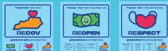
The City of Covington Economic Development Department partnered with the Covington Business Council on a social media signage and wayfinding campaign.

THANK YOU to Covington businesses for helping provide supplies to the city's first responders early in the pandemic.